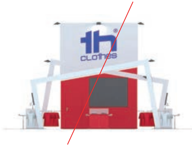
Change logo colours