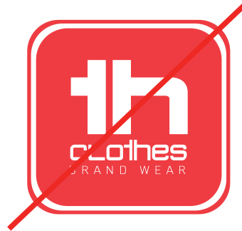
Change the format