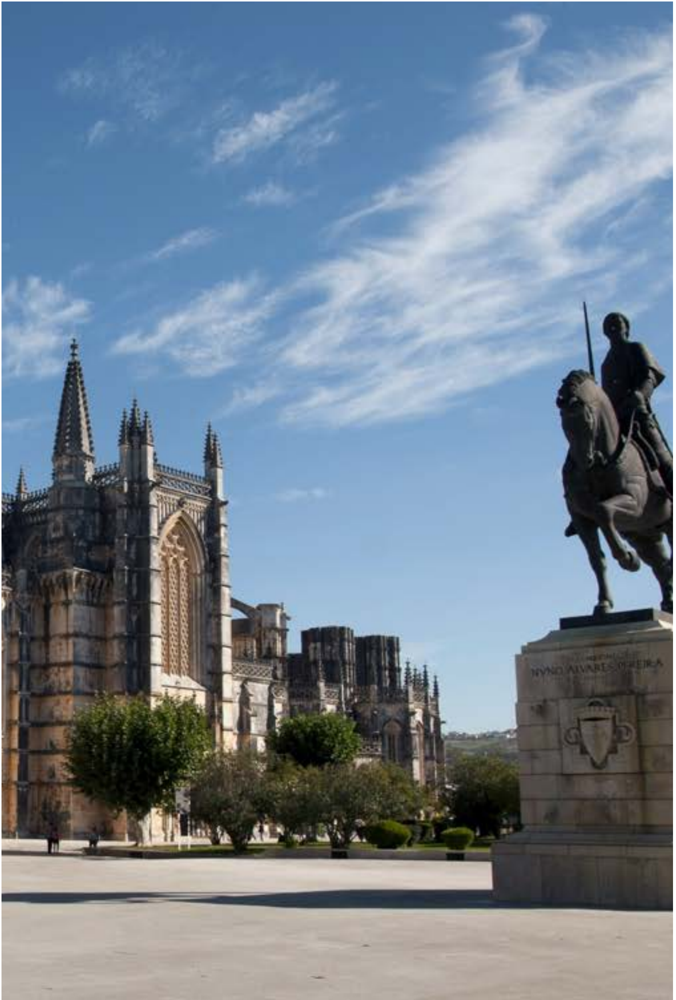
📍 Mosteiro de Santa Maria da Vitória, Batalha, Leiria, Portugal